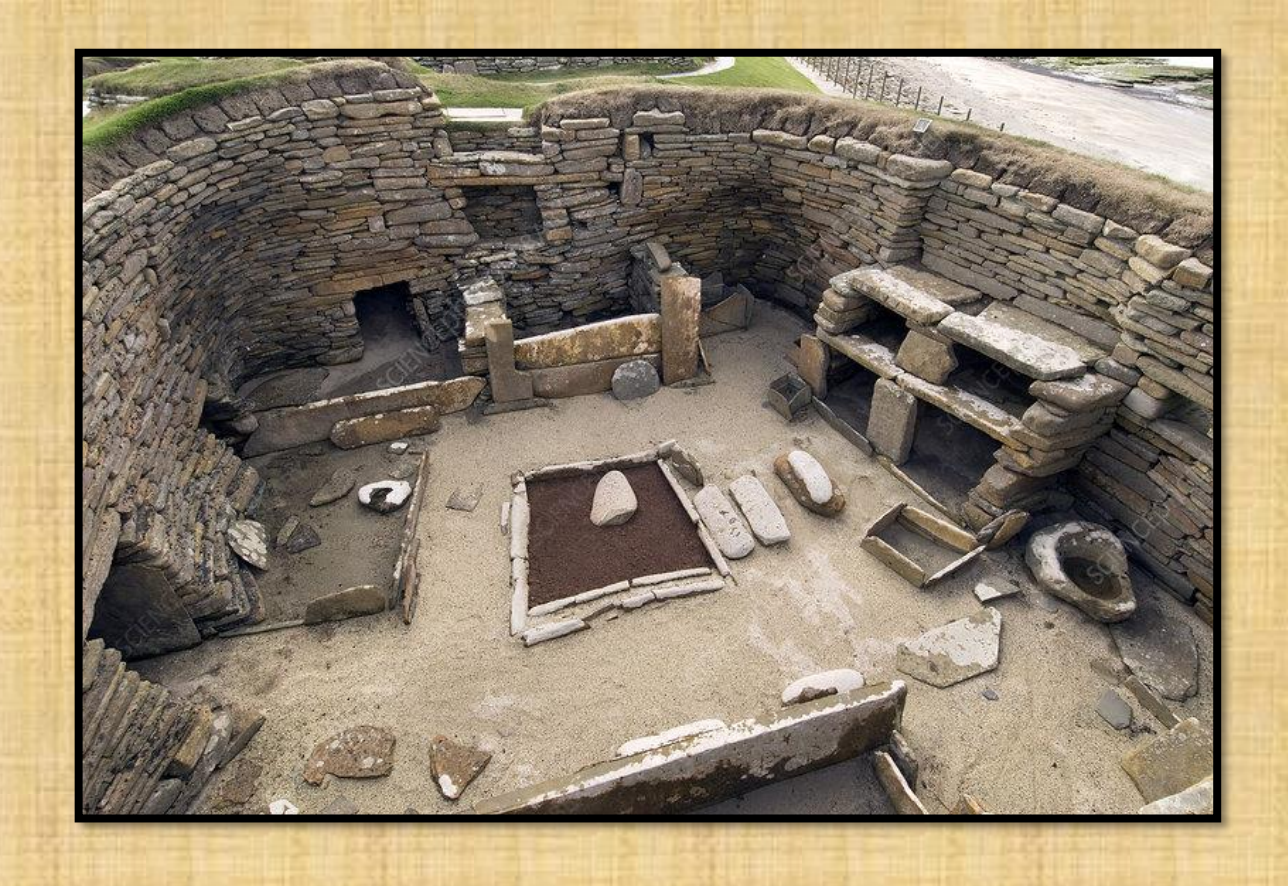
TOOLS FROM THE NEOLITHIC AGE